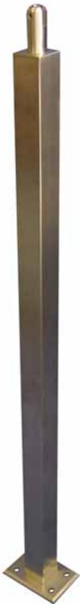
Square Post (Top Mount) JN300 - 980mm x 40sq JN301 - 900mm x 40sq

Stainless steel & timber go great together in the modern home. Please take the time to view our website to see the range of timber products that we manufacture for use with stairs. hammersmith.com.au