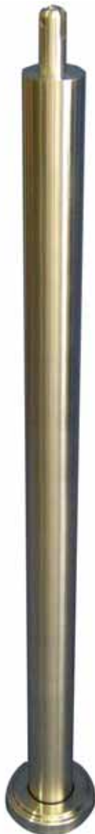
Round Post (Top Mount) JN302 - 980mm x 50Ø JN303 - 900mm x 50Ø