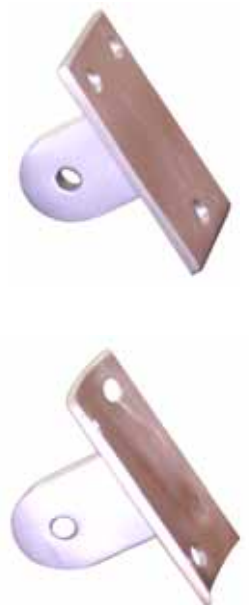
Flat Saddle JN306 Curved Saddle JN307