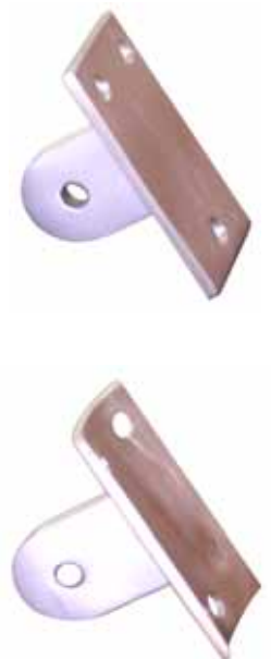
Square Post (Top Mount) JN300 - 980mm x 40sq JN301 - 900mm x 40sq

Stainless steel & timber go great together in the modern home. Please take the time to view our website to see the range of timber products that we manufacture for use with stairs. hammersmith.com.au